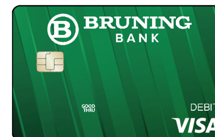
TEMPORARY DEBIT CARD

Same look, same great experience! We have been offering temporary debit cards for about a year now and our customers love the ability to walk out of the bank with a card the same day they order it.