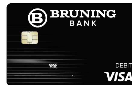
PERMANENT DEBIT CARD

Our new black card will stand out in your wallet and along with CardValet, Mobile Banking and our helpful customer service, will be our go to payment option!